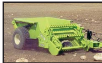
RS320 "Jumbo" Conveyor Type Rock Picker

Check out Schulte's high quality conveyor type and reel type rock pickers. These machines are your best choice for continuous picking of windrowed rocks.