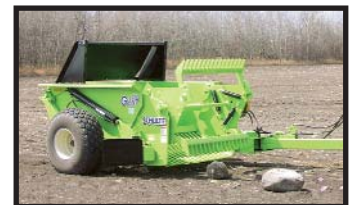
2500 "Giant" Reel Type Rock Picker

Schulte Industries Ltd. reserves the right to change the design, material and specifications of its products without notice. Illustrations may include optional equipment and accessories, and may not include all standard equipment. Part No. 1000-142